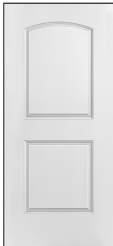
2 Panel Roman (VSP2B)